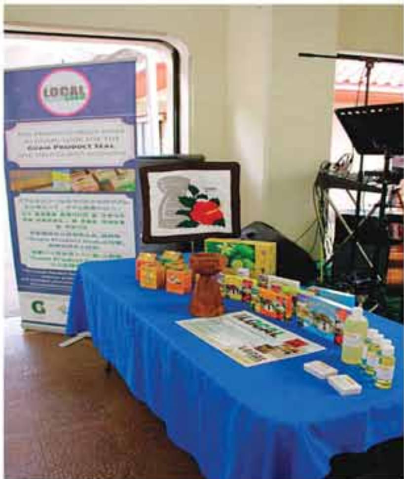
Buy Local Table Display at Chamorro Village 7/18/2012

• Build Guam's tax revenue base and put to good use. Local businesses would directly impact