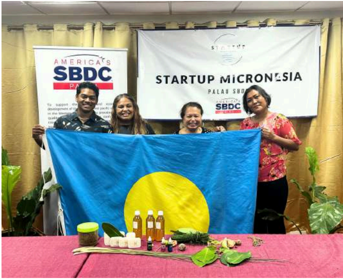
SUM 2024 1st Place Winner, Team Karuruul el Keruul, Palau