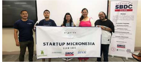
SUM 2024 3rd Place Winner, Ensa'hi, Guam