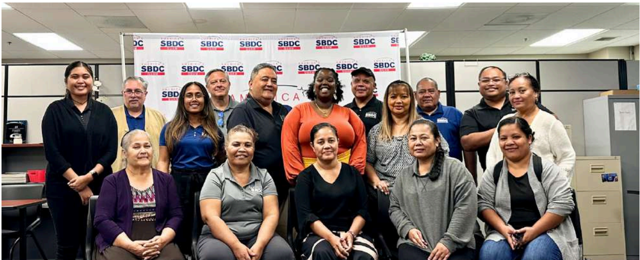
Pacific Islands SBDC Network Advisory Board Meeting and Professional Development Trainings, May 15 - 16, 2024