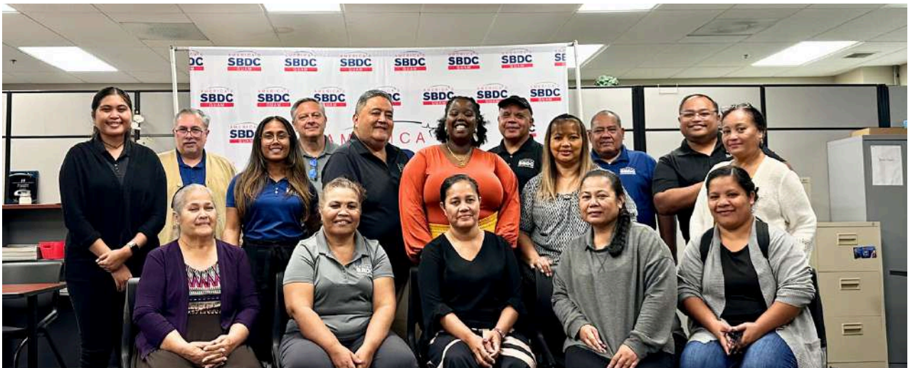
Pacific Islands SBDC Network Advisory Board Meeting and Professional Development Trainings, May 15 - 16, 2024