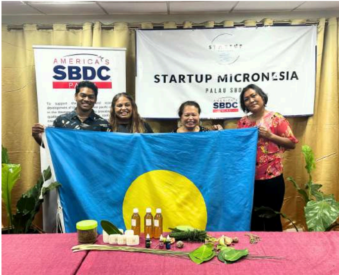
SUM 2024 1st Place Winner, Team Karuruul el Keruul, Palau