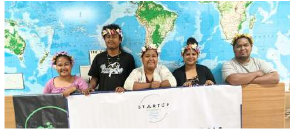
SUM 2024 2nd Place Winner, Fab 4.5, Yap